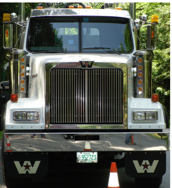
ETTI's 2004 Western Star Flat Bed

Great equipment management can mean the difference between job profit or loss . With the cost of equipment on the rise, equipment management will have a large part in your profits at year end.